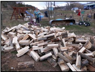
Firewood deliveries at Busby and a neutral site for elderly and those in need.

Our partners from AL take the whole year to gather, purchase and “pack the trailer” they bring to MT every year. They give our Food Bank a much needed boost before the winter months set in and we have those extremely high power bills. The food and boxes of new, warm winter clothing, blankets, shoes, socks , p.j,’s etc. are such a blessing to so many in need. These donations went to the Boys & Girls Club and Homeless Shelter.