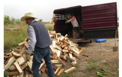
2nd Row: Unloading wood on the Crow Reservation